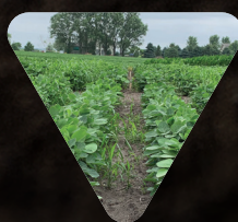
Fierce® XLT 5 oz

How often will your residual provide greater than 90% annual grass control 5 weeks after emergence? In trials, Tendovo delivered 90% control, beating the competition for control of annual grass weeds.