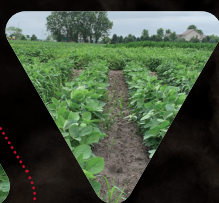
Zidua® Pro 6 oz