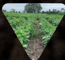
Sonic® 6 oz