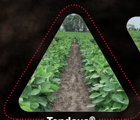
Tendovo® 2.1 qt